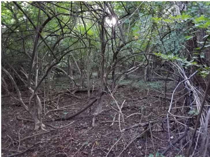
BEFORE - Japanese (bush) Honeysuckle and wild Grapevine

The plan included a professional excavator to cut and grind the invasive plants, the purchase of native trees, shrubs and grasses with restoration planting by MLNC led volunteers.