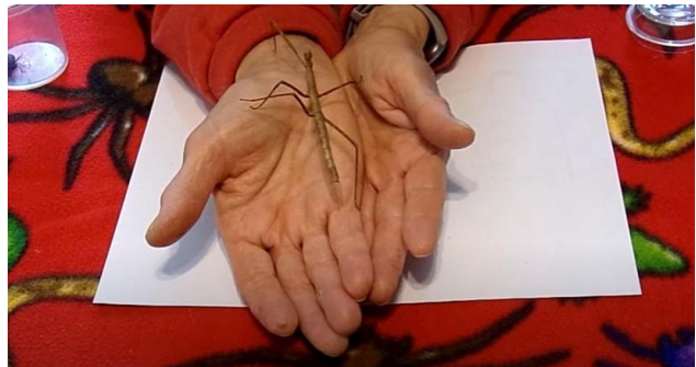
Walking Stick featured during Invertebrates Station