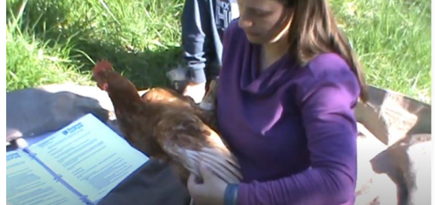
Live chicken featured in Bird Station

For the first time, School in the Park is available to anyone . Check out our Facebook page for links to the videos.